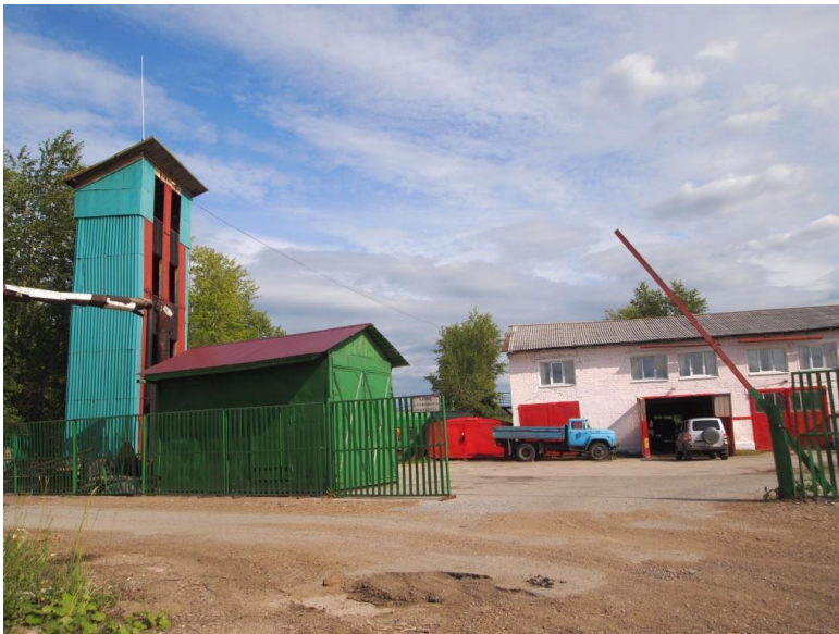
Railways. Property of OOO "PKF Vud Land"