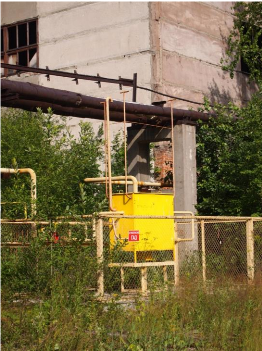
Gas network, 195 cubic meters per hour