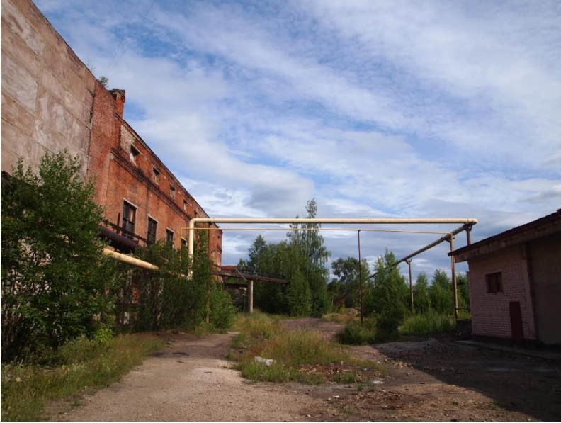
Power substation MRSK-Urala